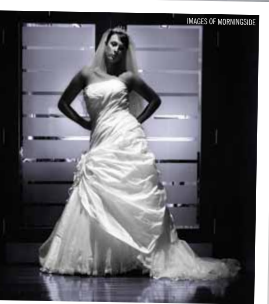
IMAGES OF MORNINGSIDE