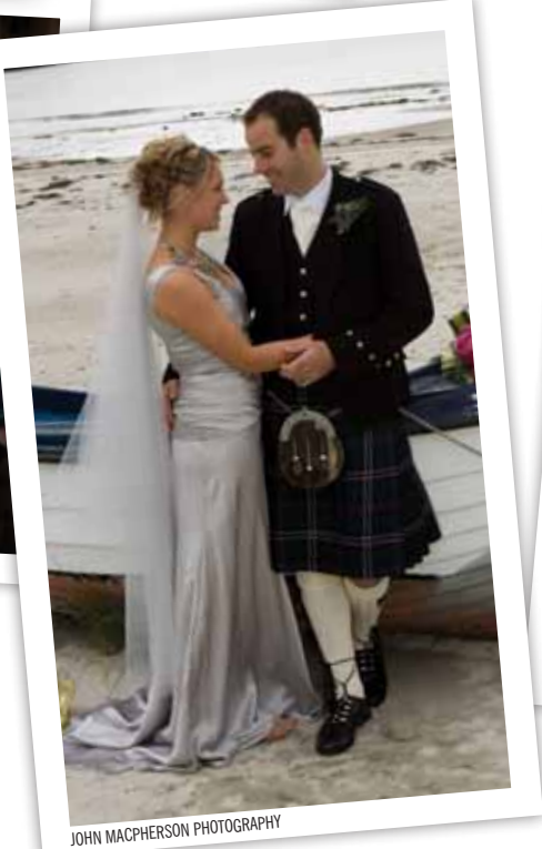
JOHN MACPHERSON PHOTOGRAPHY